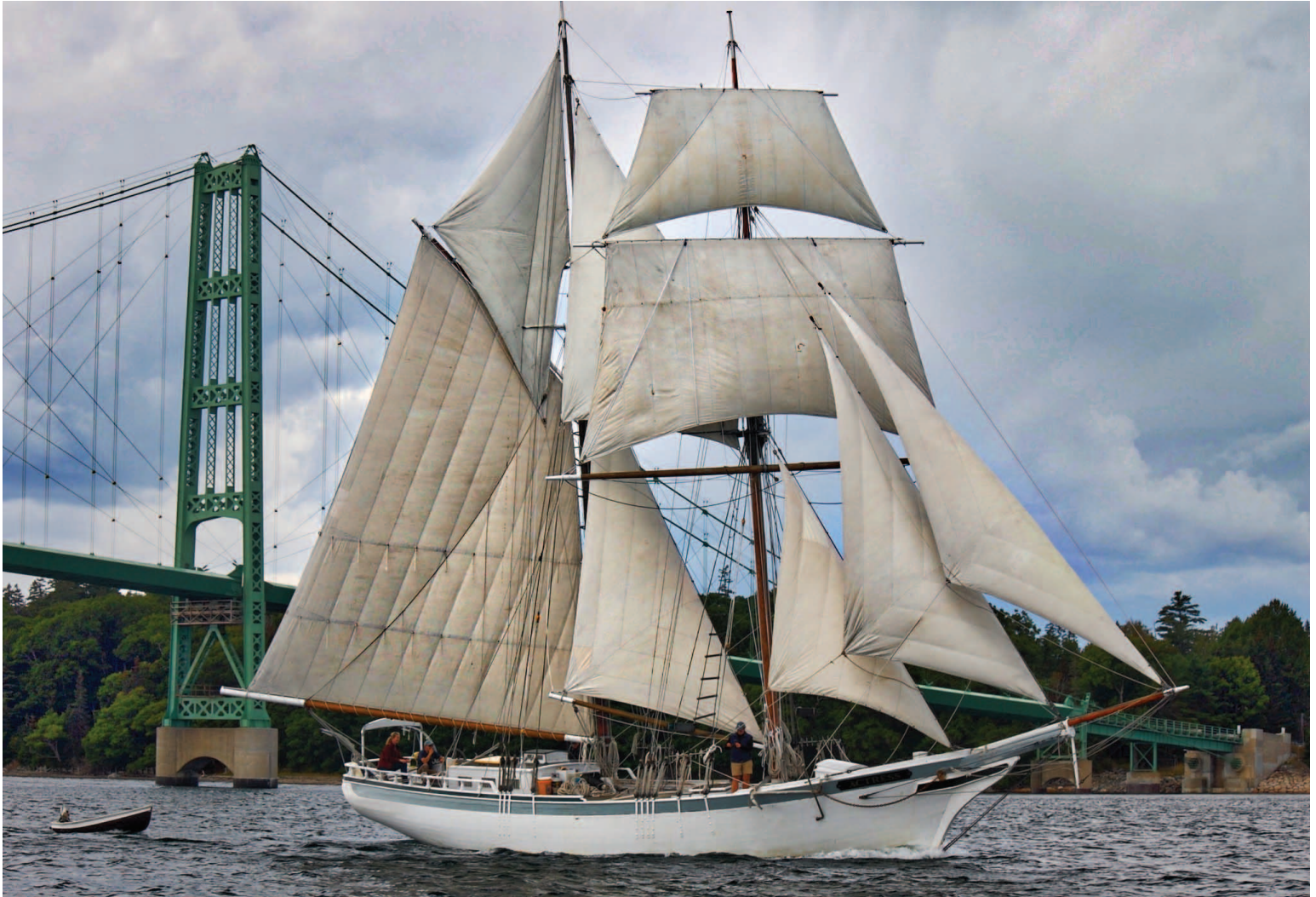
SWIFT in Eggemoggin Reach

GRACE BAILEY 🏆 MERCANTILE 🏆 MISTRESS 🏆 SALLY 🏆 SWIFT